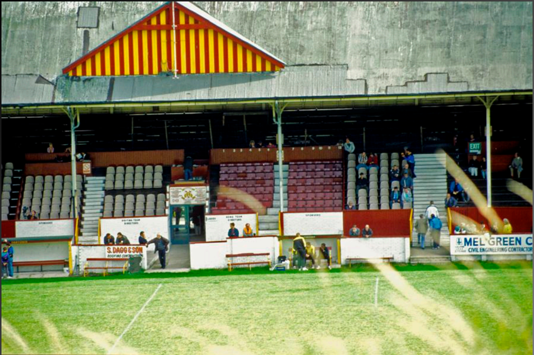
Huddersfield – Main stand at Fartown