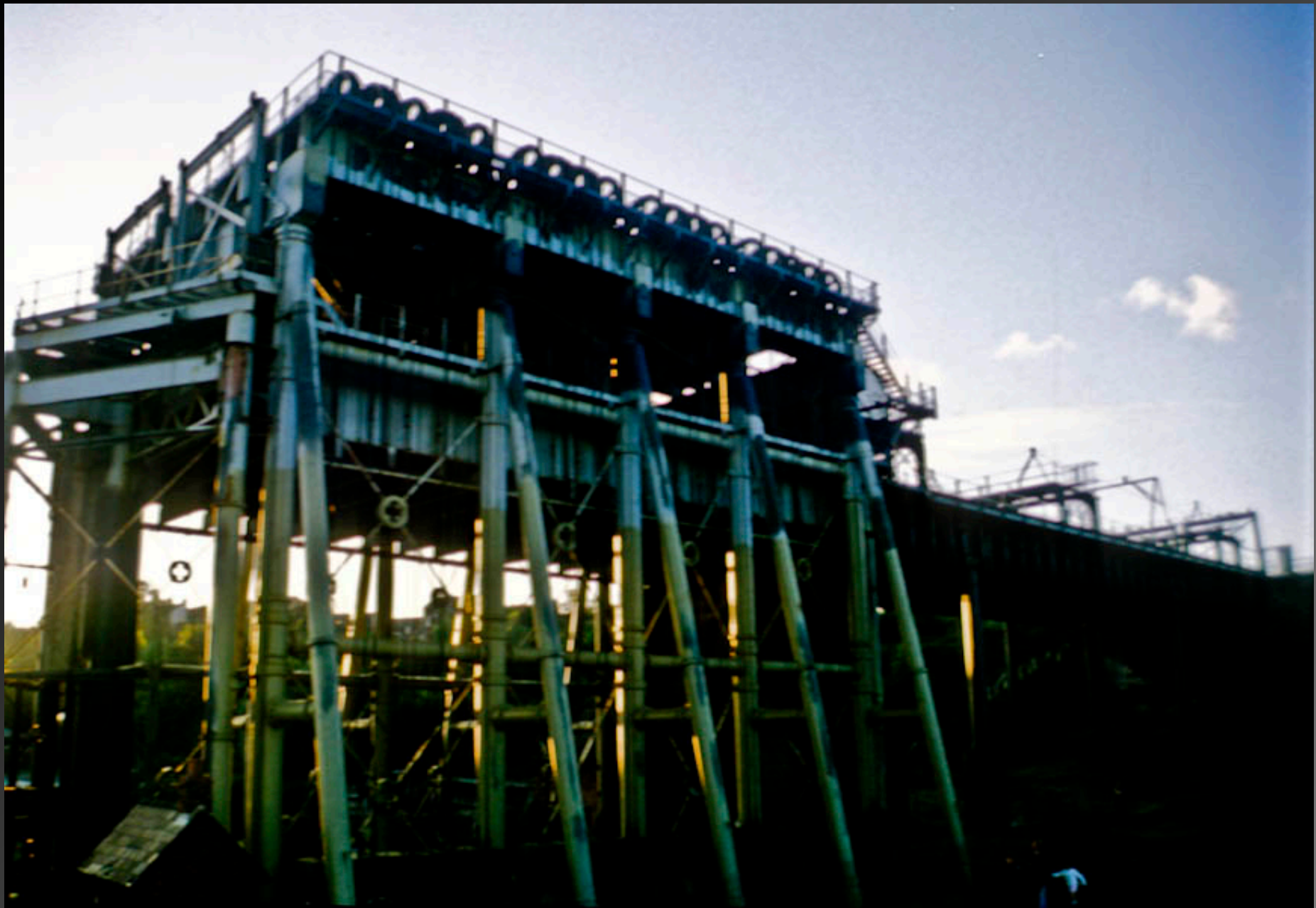
Anderton Lift, Trent & Mersey Canal <-> Weaver Navigation