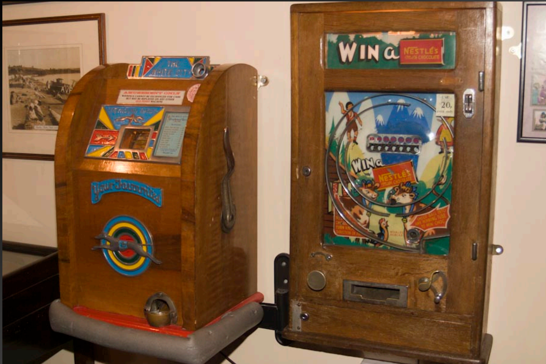
Chat & Reminisce at the Bygones Museum, Torquay