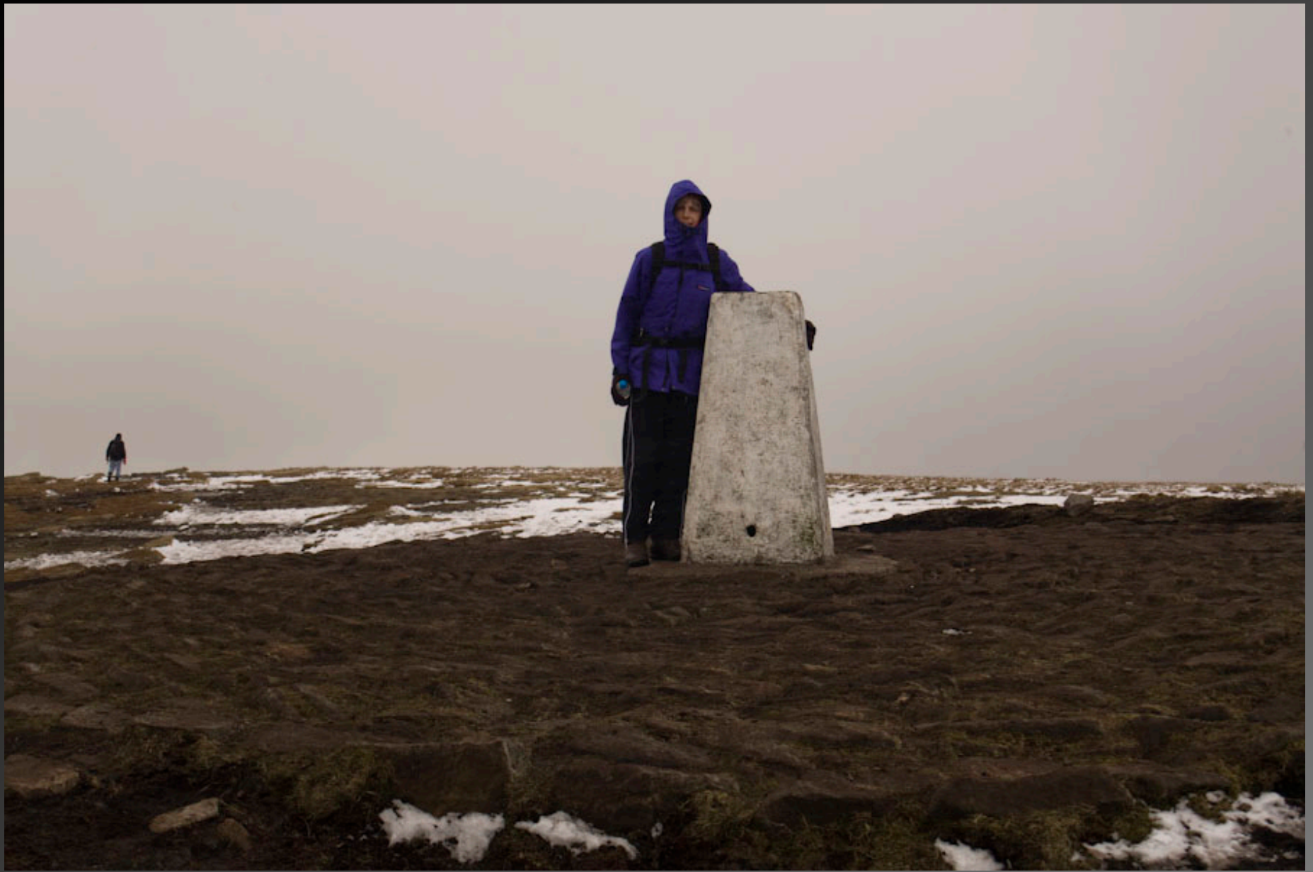
Pendle Hill, Lancashire