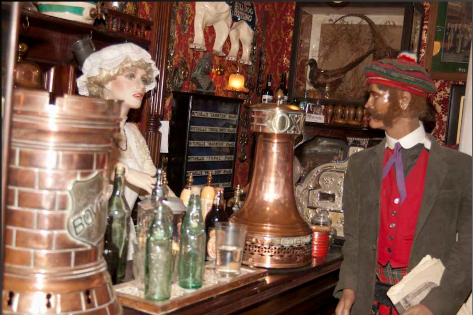
Chat & Reminisce at the Bygones Museum, Torquay