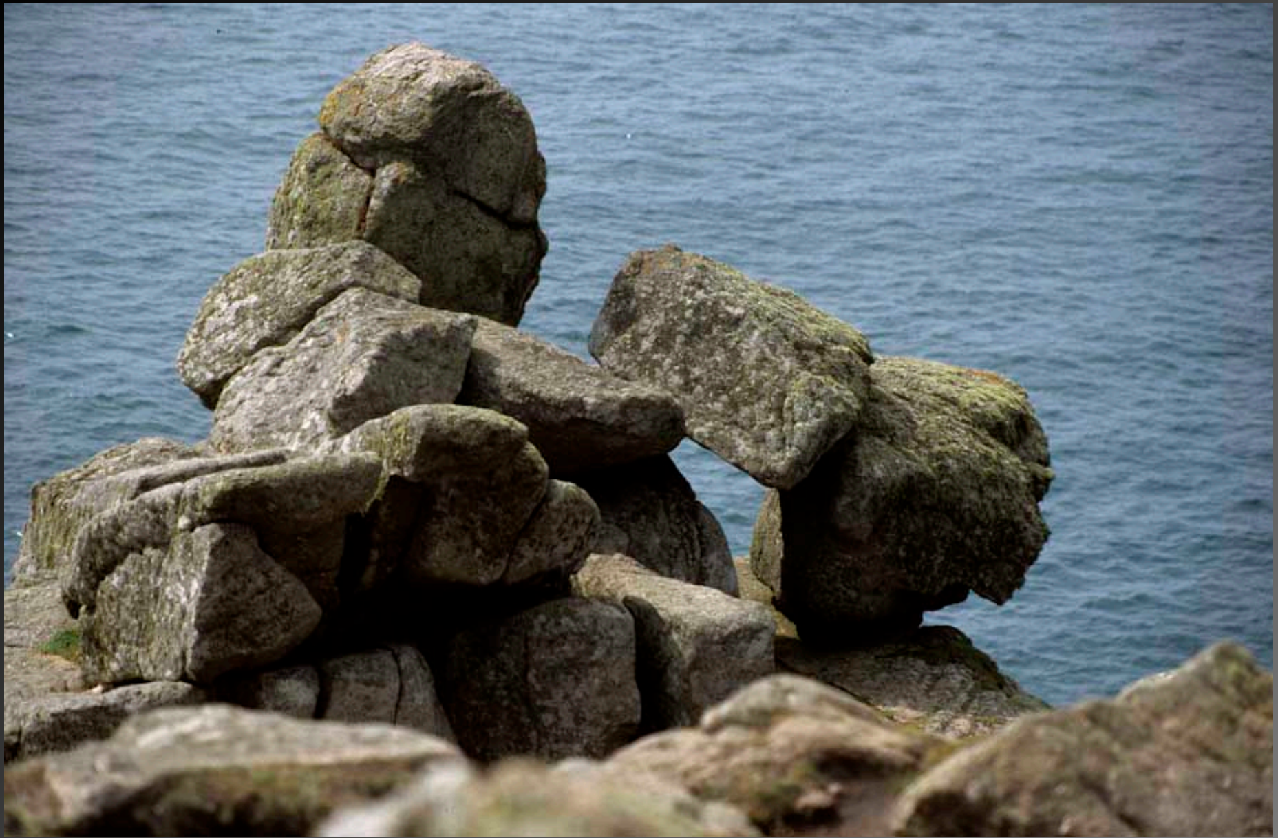
Land's End, Cornwall