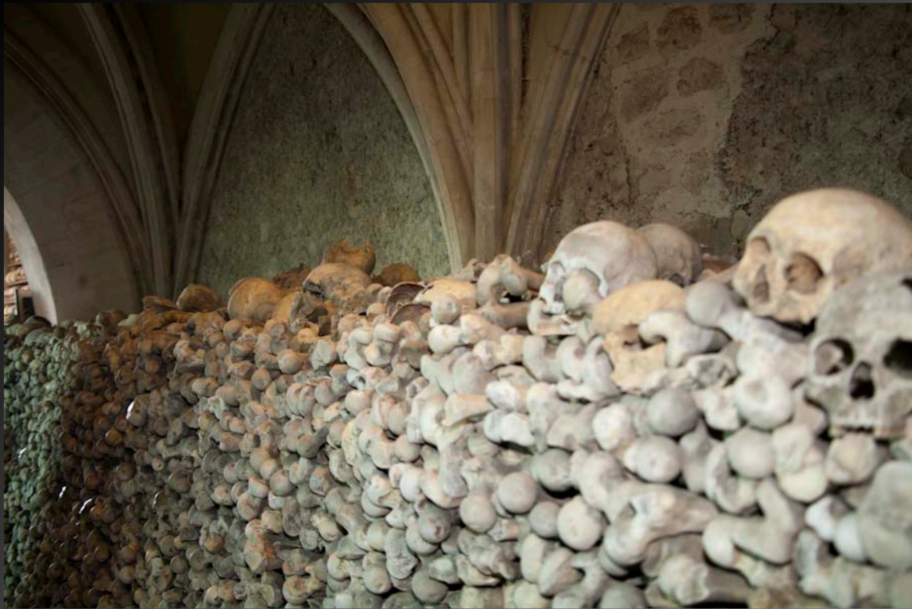
St Leonard's Church, Hythe , Ossuary