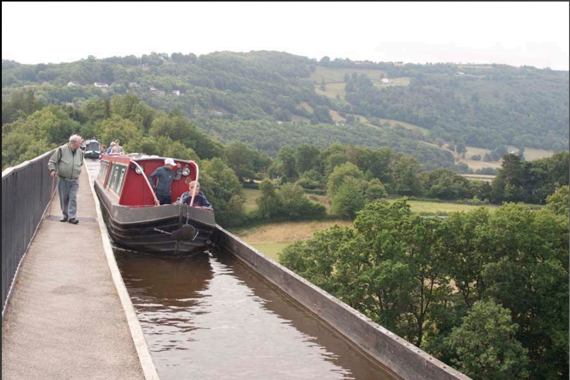
Pontyscylte Aqueduct, Llangollen Canal